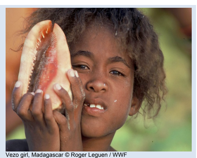
vozo giii, iliadagassai e Nogoi zogasii i vivii

The partnership approach – which is the essence of the NMCi – will allow a better spread of resources, more strategic investments, and will deliver results that will be bigger than the sum of individual projects.